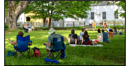
Concert on the Green!

On Saturday, Sept. 12, please join us for our Canterbury Artisan Market, where you can find amazing artisanal handmade treasures. Please come prepared for social distancing -- and bring your favorite masks. The market is 10 am to 5 pm, $12 for adults, youth free. Members of Canterbury Shaker Village half-price. Purchase advance tickets, find updates, or find out how to participate www.shakers.org/artisan-festival-at-canterbury-shaker-village/ .