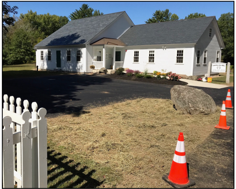
The parking lot for the town offices in the new Sam Lake House is paved and open for business.