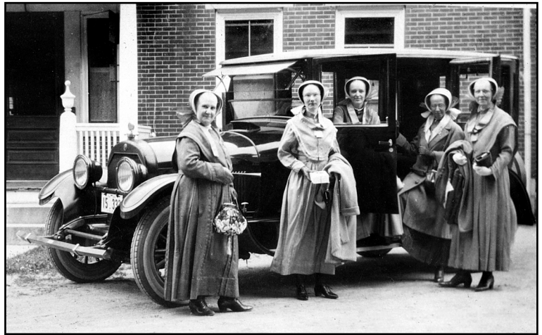
Does a Vintage Car Show at the Shaker Village make historical sense? Why, yes it does! The Shakers loved automobiles.

Shaker Chair in a Box (Nov. 2 & 9, 9 am to 5 pm): Twenty-five chair kits recently arrived at the village and help is needed to put them together. The chairs will be used in our rental facilities! The Village is offering the special workshop rate of $50/person (normally $185 for the 2-day class) for anyone interested in helping with this project. Email info@shakers.org for the special registration discount code.