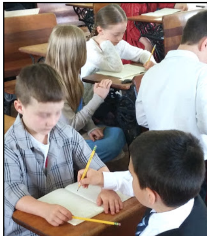
From last year's One-Room Schoolhouse program ...