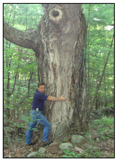
It'd take three people to put their arms all the way around this old maple — and it's not the only one like it to be found.

Start your hike about halfway up the first hill on Borough Road formerly known as Palletborough Road. Look for the Hamptons' driveway on the west side of the road. Park here but don't block the driveway. The old Osgoodite road, now no more than a