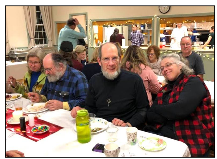
It's not just the great turkey meal. It's the great company!

Did you know? Every resident of Canterbury is an automatic member of the Historical Society. We have given up on the idea of our being "a dues membership only" organization given that all of us, each one, is helping to make history every day in Canterbury as we live, work, volunteer and play. So welcome and please join us in the many projects we sponsor.