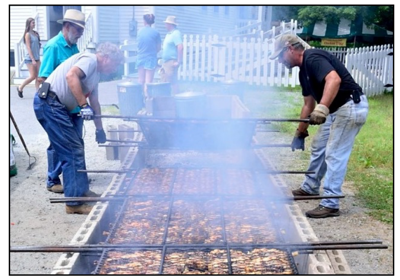
Wait! Did someone just say barbecue chicken?!?

— The also, also world famous Book (and other Media) Sale is taking donations of books and other media until July 9 at the Byre, 112 Southwest Road between 1 and 6 pm. Look for signs indicating where to deposit books. From July 10-24, bring donations to the Meeting House in the Center on Wednesdays (4-7 pm) and Saturdays (9-12 am). Volunteers wanted to help with collecting and organizing at the Meeting House on Wednesdays from 4-7 and Saturdays from 9-12: (July 10, 13, 17, 20, and 24); setting up on Friday afternoon, July 26; helping and then closing down on fair day. Questions? Volunteering?