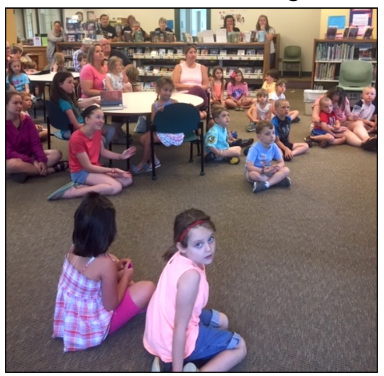
Who's at the library? Everyone! And what do they find there this summer? A Universe of Stories!

Attention Middle School students! Elkins has copies of each title on your summer reading list. Please remember to return your books on time!