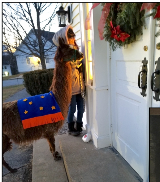
These are scenes from the Canterbury United Community Church's fifth annual live nativity and potluck in December.

Friday, Jan 24: No school, staff-in service day, CES. Page 5.