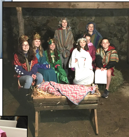
Participants young and old wound through the town center, concluding their trek in the barn at the Canterbury Center B&B!