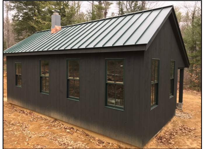
The Exchange will be held in the soon-to-be completed meetinghouse at Church of the Woods.