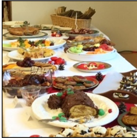
If this looks to you like a Bavarian Christmas Holiday Open House table, you're right!

1000 Books Before Kindergarten! The single most important thing you can do to prepare your child to read independently is to read to them every day. Come in and get a chart to track your child's reading. Turn it in and your child will receive a gift at the Circulation Desk.