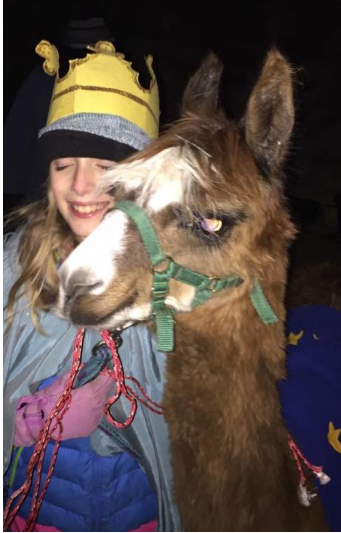
From last year's event.

Come join us Sunday, the 16th at 4 pm for our advent walk, carol singing, and Christmas story telling in the town center, followed by a warm and comforting potluck meal in the Parish House.