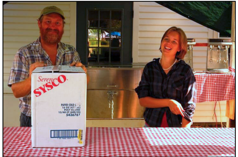
What could be better than these friendly faces and their Canterbury Fair Frappe Bar? Absolutely nothing, that's what.

If you are new to town, reading this and wondering what all this praising and gratitude is about, it's about living in this remarkable little town for almost 30 years and getting involved. If you moved here because you liked the feel of Canterbury, it's because we who live here participate, get involved and make it be the special place it is. We introduce ourselves to neighbors, wave as we drive by each other, bring a casserole when