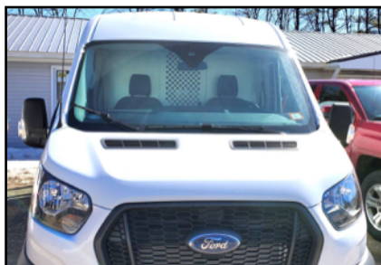
Someone's truckin'. Page 9.

A sweet new Shaker Village fundraiser! Page 6.