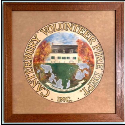
Historic seal on display: Painted by a Shaker sister, shared in memory of late fire chief. Page 3.