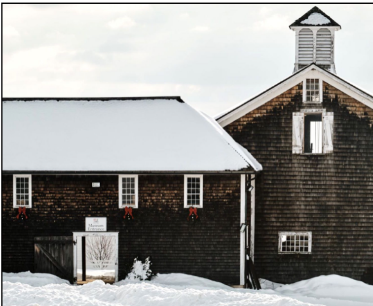
The Horse Barn at the village, dressed for winter.