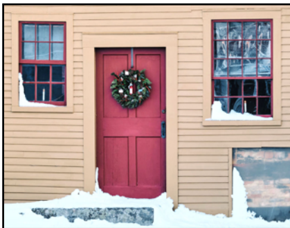
Shaker Village granted: Several generous grants will provide vital support. Page 5.