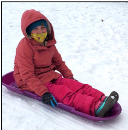
CES students hit the slopes: By which we mean the hill beside the school! Page 4.