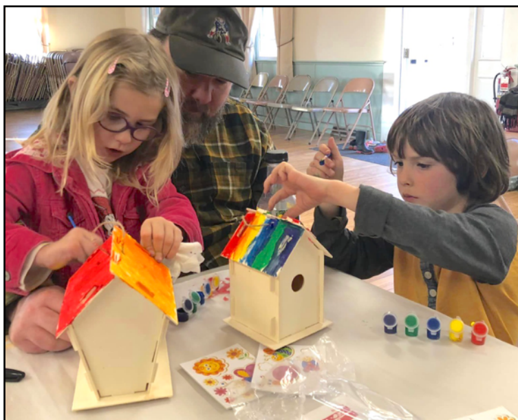
What bird wouldn't want to live in a birdhouse that beautiful?

Upcoming Cloverbuds meetings and themes are listed below, and new members are always welcome. Unless otherwise noted, Cloverbuds meetings are held on the first Monday of each month at 5 pm at the Canterbury Parish House, 6 Hackleboro Road, in Canterbury.