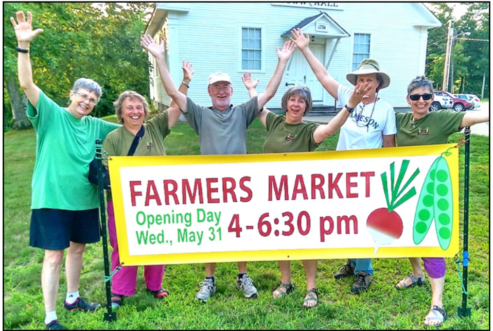
A distinguished group, these Farmers Market enthusiasts!

Just so you know, dogs are always welcome at the market but on leash, please! We have a water bowl up front by the Market Info Tent.