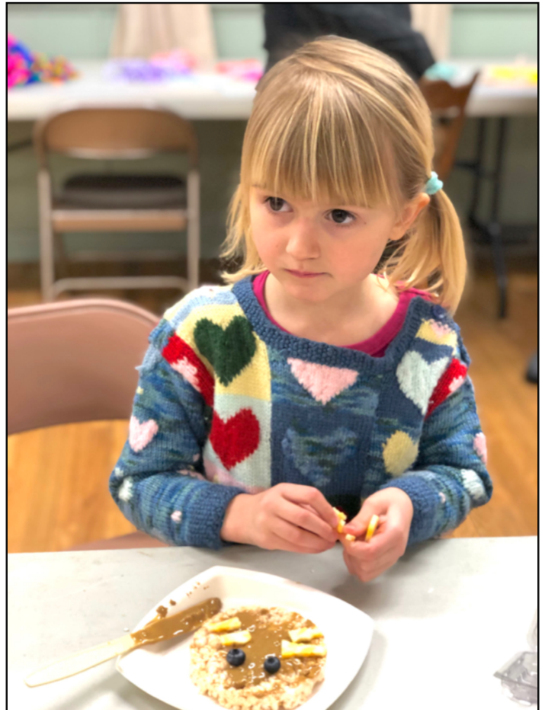
A healthy food artist at work in the March meeting.