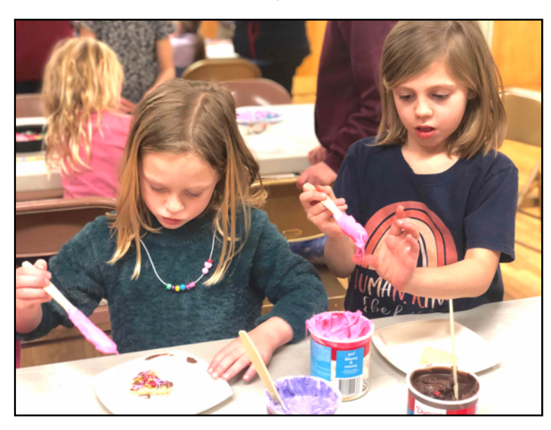
Two of Canterbury's Cloverbuds in action!

Monday, March 6, at 5 pm: 4H Learning Theme Healthy Lifestyle. We will learn about healthy food and lifestyle choices,