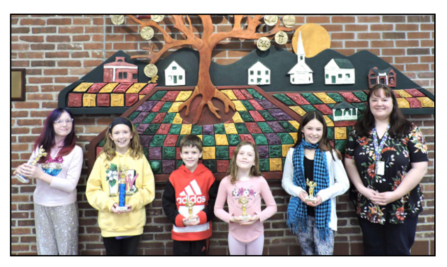
Congrats to Canterbury Elementary's spelling bee winners! Page 8.