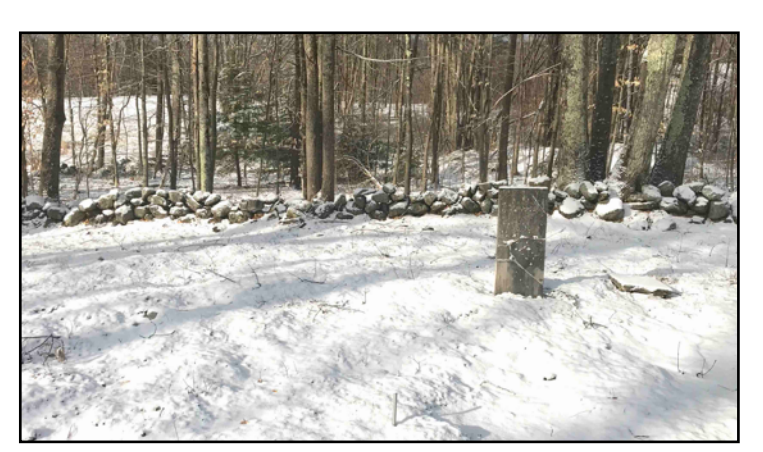
Who knows all the stories Canterbury's cemeteries can tell?