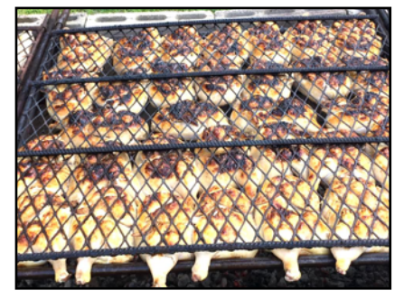
Can't you just smell the chicken?

Food Tent: Chris Cornog needs about a dozen or so volunteers for shifts. You can reach Chris at 603-496-8733 or