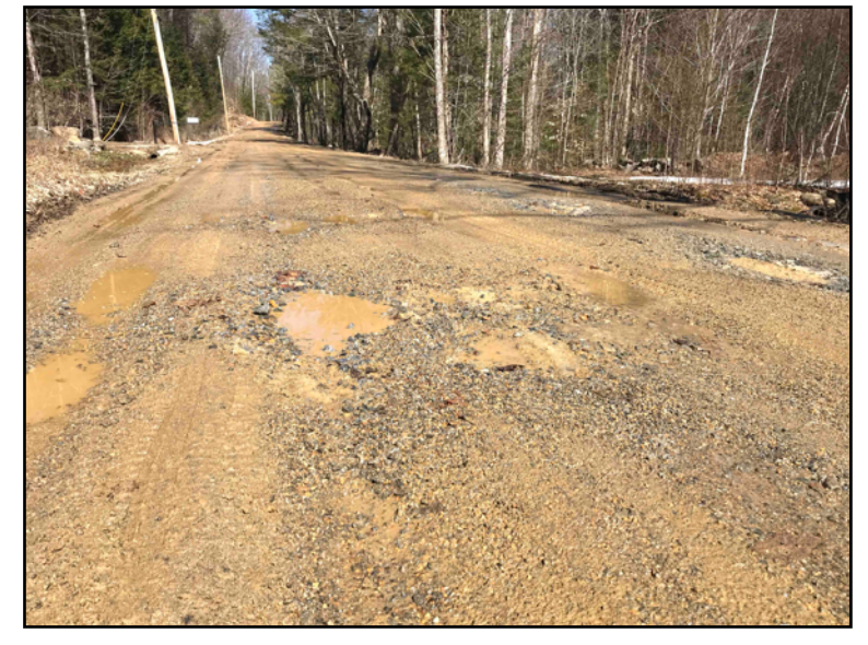
Oooey gooey Foster Road. Yes, there are much worse spots in town. We stopped here because we didn't want to get stuck!

You had to get a running start and maintain your momentum. Slowing for curves didn't work out well. I couldn't see them anyway for all the mud on the windshield. The ditch waited. You knew you'd hit good muddin' when you could feel the mud sucking on your tires and throwing the truck from one side to the other, the steering wheel almost useless. If you slowed down it was all over. Maintaining, or preferably, if possible, increasing your speed became critical. Time enough to slow down if you made it through. Then you could drive around proudly, showing off your truck, so thoroughly coated with mud that its original color was unrecognizable. If you got stuck you could hope the mud would freeze up sufficiently overnight so you could drive out the next day, or find a farmer with an