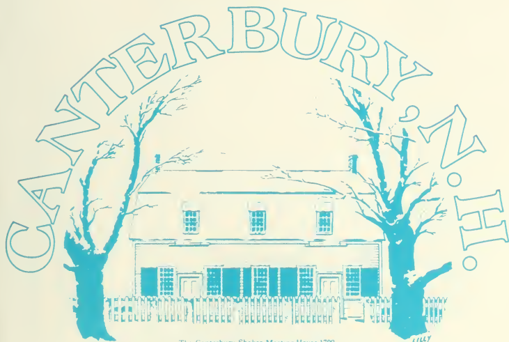
The Canterbury Shaker Meeting House 1792