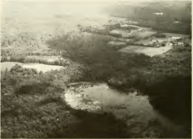
Aerial views of "Meeh Property under Conservation Easement" along Shaker Road.