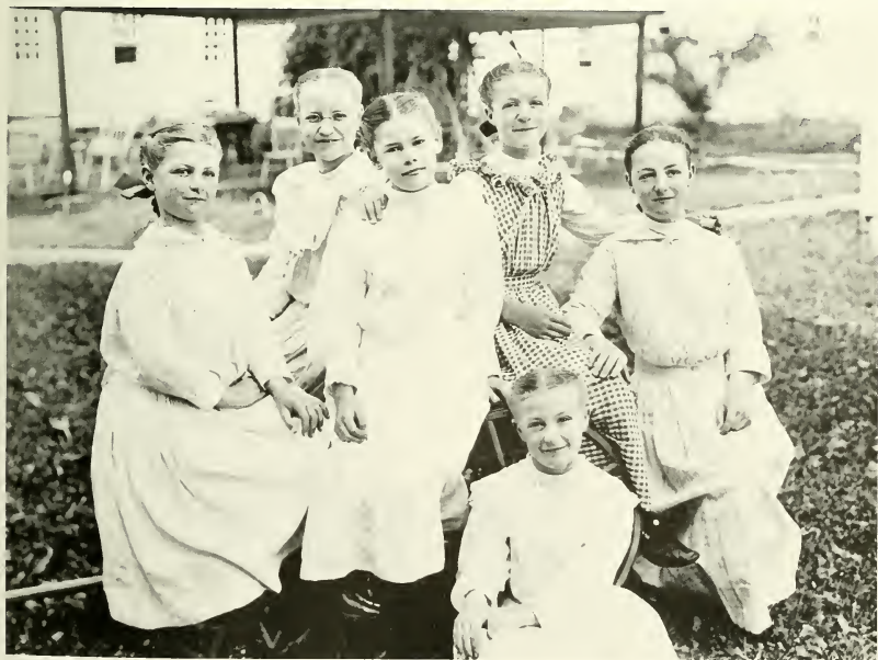
A group of girls brought up in Shaker Village