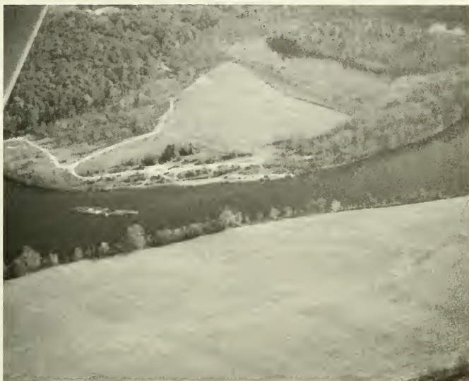
Aerial View of "Riverland" showing Beach Area, Oxbow Ponds and Farmland. Looking East from Boscawen Side of River.

In addition to its other activities, the Conservation Commission has continued its efforts for land conservation.