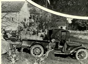
Sisters going to Blacksmith Orchard to pick apples