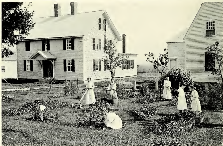
Sisters mowing their gardens in front of the Ministry and the Meeting House