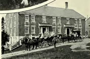
Sisters waiting to go into town in front of Trustees Office